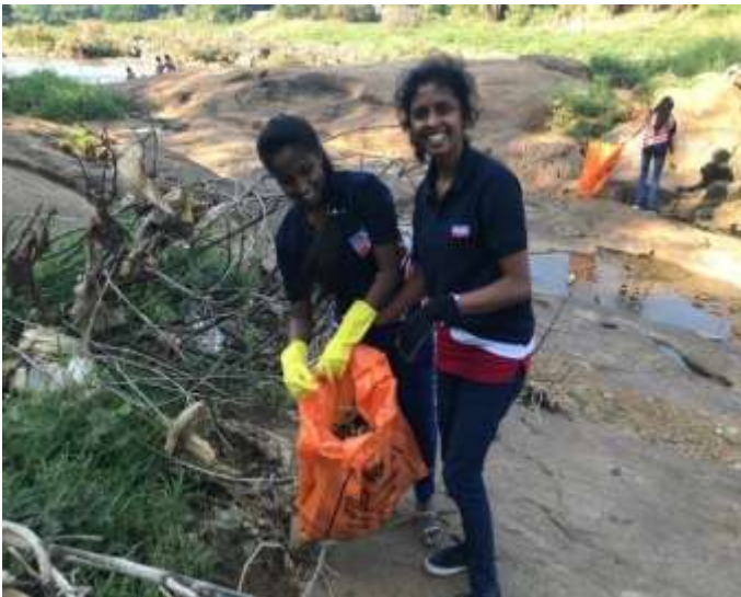
Community service– River Cleaning