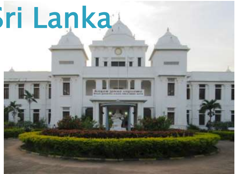
Jaffna Public Library - 1933