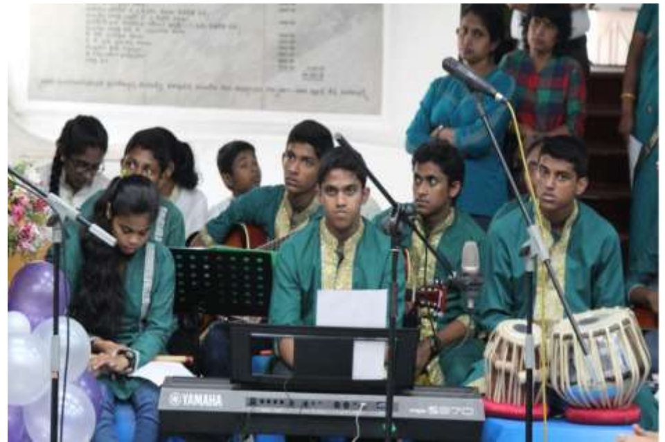
Art /Music /Entertainment