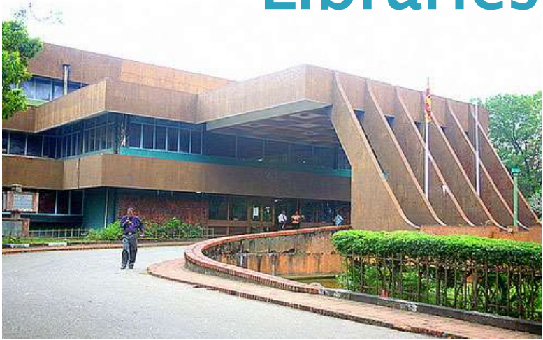
Colombo Public Library - 1925