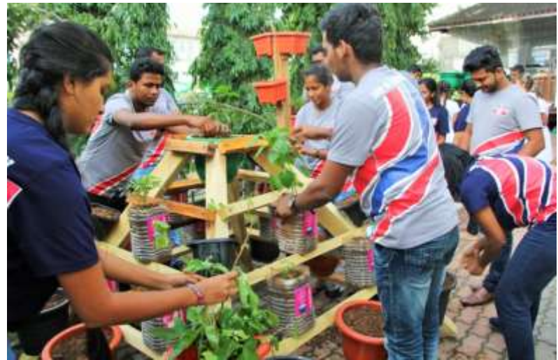
Community Service – Tree planting