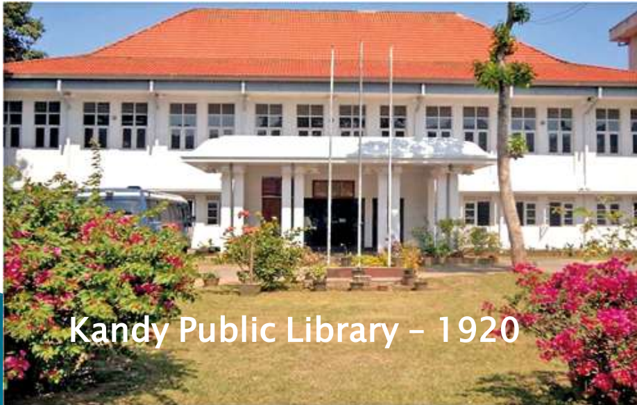
Kandy Public Library - 1920

Government Oriental Library (1870) - Colombo Public Library